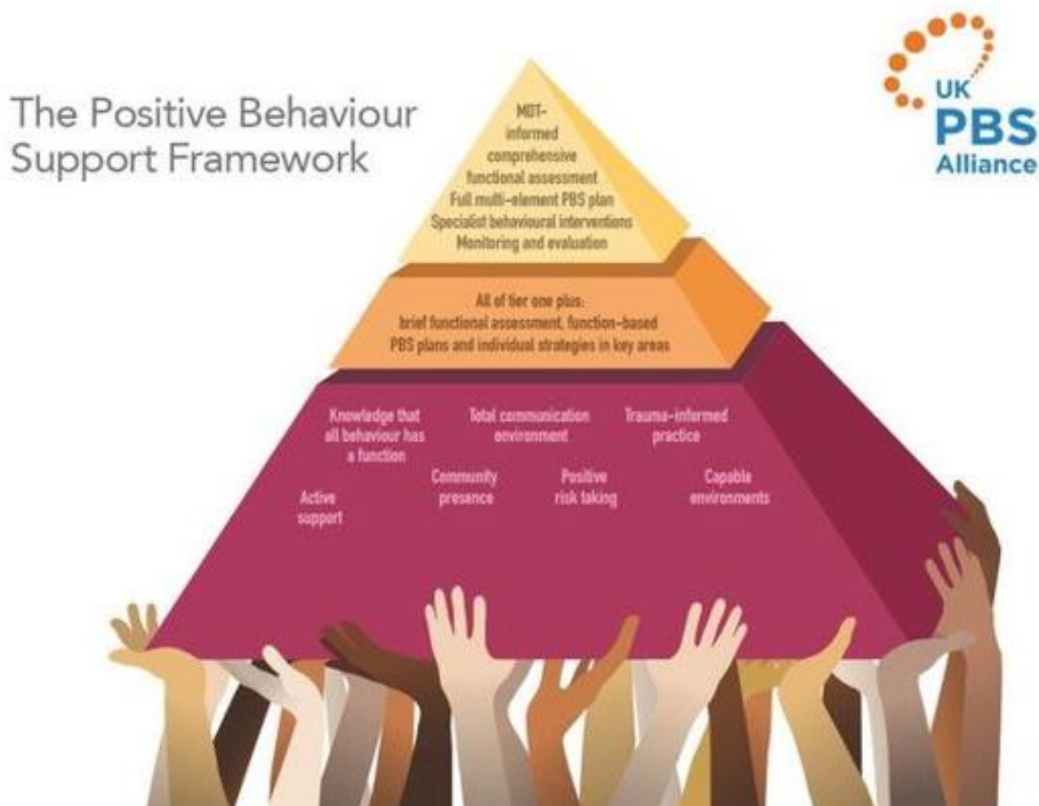
Figure 1: The PBS Framework

Services and organisations often provide a mixture of support at multiple levels and may have varying PBS workforce development needs at different times. The PBS Framework with three levels of prevention, shown in figure 1 below is adapted from the schoolwide model ( www.pbis.org.uk ). This framework helps to understand the range of supports needed for individuals and how these might inform workforce development priorities. The PBS Framework makes sense when visualised as a pyramid with levels representing a hierarchy of needs and supports.