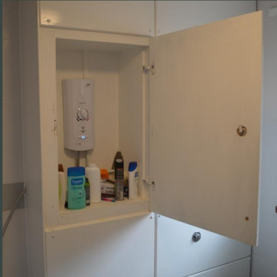
Concealed Shower Unit