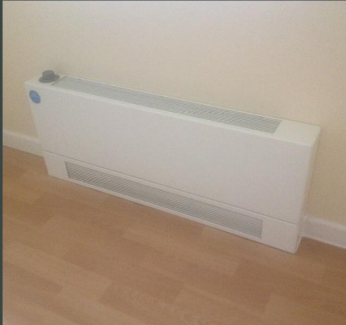
Low Surface Temperature Radiators