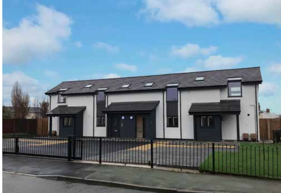
PHOTO ABOVE: ONE OF OUR COMPLEX NEEDS PROPERTIES PHOTO BELOW: THE SPECIALLY ADAPTED BATHROOM FROM THE ABOVE PROPERTY