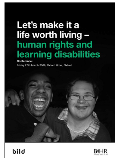
BILD's first Human Rights conference was held in March

Recent work has focused on the Mental Capacity Act and the Deprivation of Liberty Safeguards and we have also been completing a project called Hearing from the Seldom Heard which focuses on complaints for people who do not use words to communicate. We have been successful in a funding application for an 18 month project, Excellence in BME (Black and Ethnic Minority) Advocacy, which will build on