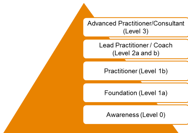
Figure 2: CAPBS curriculum development modules

The modules in the CAPBS Organisational and Workforce Development Framework are outlined below and, in more detail, in Table 1.