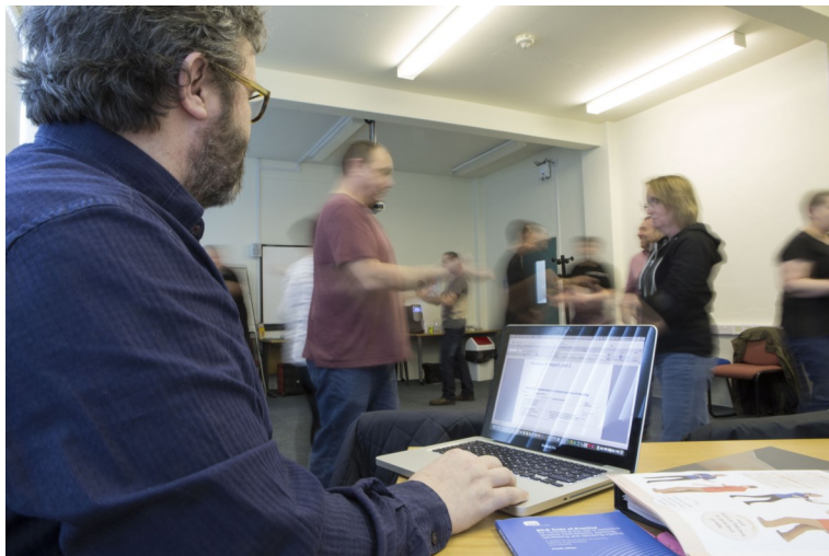
A BILD assessor, above, observing accredited training provided by a provider, and right, BILD PI Training Accreditation Scheme panel members assessing an application for accreditation